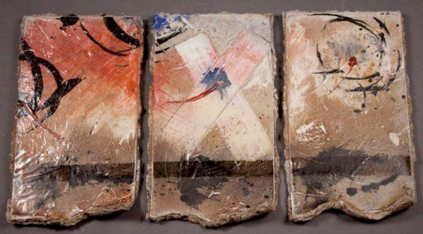
Above: Don Reitz. Triptych . Salt-fired stoneware wall tiles. Below: Don Reitz. Midwest . Salt-fired stoneware.

Round forms with textured tops are another Kuraoka signature. Early thrown wheel work had a flattened curve, recalling the tension of a convex meniscus at the top of a glass of water, just before spilling over. Kuraoka consigned these pieces to the vagaries and risks of pit-firing as well. He developed a strong palette based on contrasting velvet blacks, areas of white, cherry and the particular soft yellow of sodium fumes. It is notable that when a series of the forms were cast in bronze, the foundry was excited about the patinas Kuraoka developed and applied to the bronze surface, based on his knowledge of pit-firing alchemy.